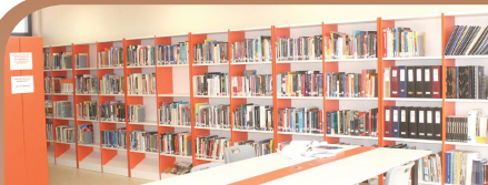
Library: Spacious Library providing needed books with extensive online library accessed by students anywhere anytime.