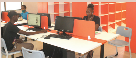
Computer Labs: Several computer labs allowing each student to be trained to be computer literate and to provide software needed for specialized training in each field.