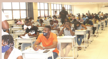
Lecture Halls and Classes: Fully airconditioned classes with state of the art technologies to facilitate learning.