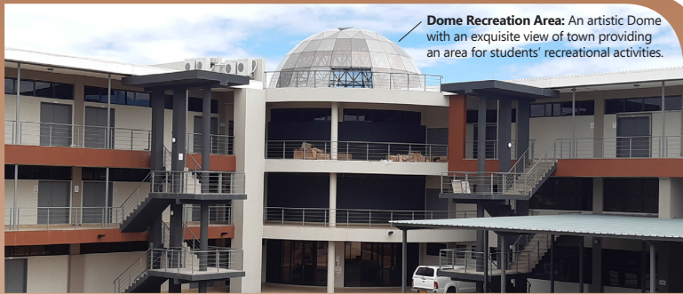
Dome Recreation Area: An artistic Dome with an exquisite view of town providing an area for students' recreational activities.