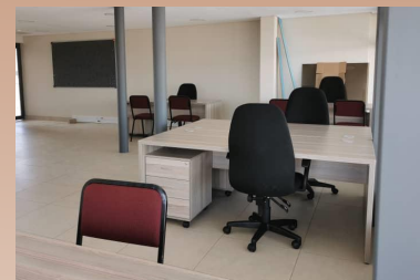
SRC Office: Modern fully furnished and well resource office for the College SRC team for smooth running of student affairs.