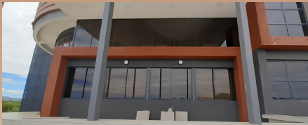
Student Centre: Common area for students to relax and access the tuck shop, printing and photocopying services and the restaurant.