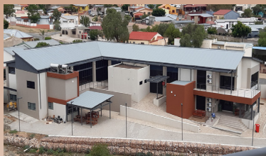
Engineering Block: Provides Workshops and Laboratories for Engineering students.