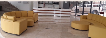
Reception: Modern reception for student enquirers and ample space for student relaxation.