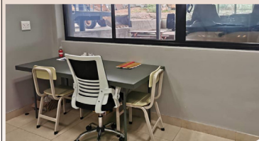
Student Centre: Common area for students to relax and access the tuck shop, printing and photocopying services and the restaurant