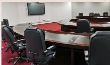
College Council Chamber: A state-of-the-art boardroom for staff meetings and smaller sized student meetings.